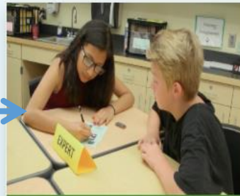
Climb the Ladder